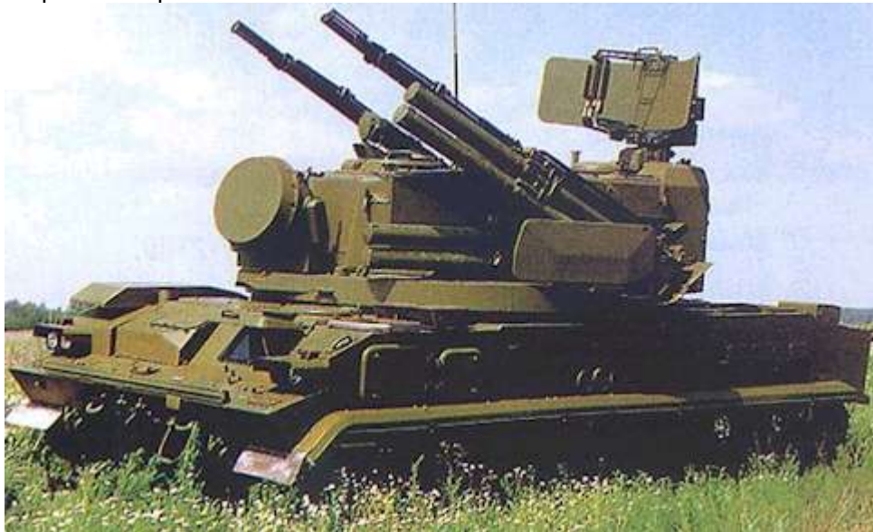
SA-19 Grison (2S6 Tunguska) is capable of engage air targets with IR missiles at altitudes from 15 up to 3500 meters. In close range, its four 30mm cannons are able of 5000 shots per minute!

Target – A north korean tank battalion consists of 41 vehicles and includes 4 deadly 2S6 Tunguska (SA-19 Grison). The battalion must be attacked carefully to avoid exposure to this AD weapon. See please the tactical reference for more details.